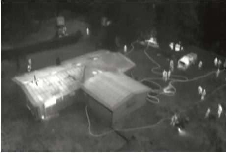
Duo Pro is an invaluable tool for fire fighters and other