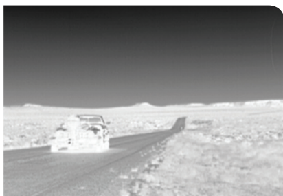
Tau image Without ACE